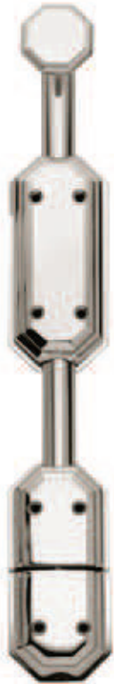
C30500 C30525 (asta-rod L 250 mm) C30530 (asta-rod L 300 mm) C30535 (asta-rod L 350 mm) C30540 (asta-rod L 400 mm)