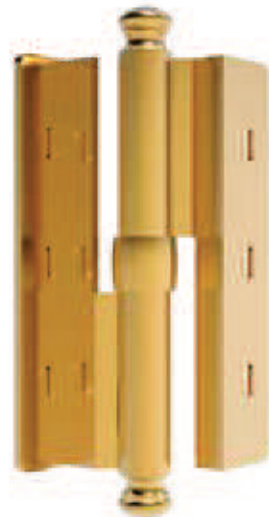
CC2010 + CCF16C 75x150