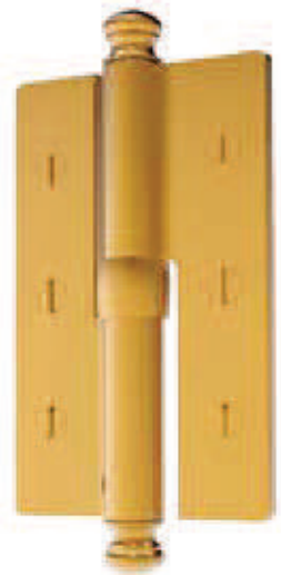
CC1010 + CCF16C 75x150