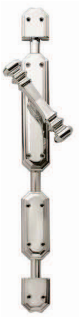
C32100 Asta C319AS non inclusa nella confezione Rod C319AS is not included in the package