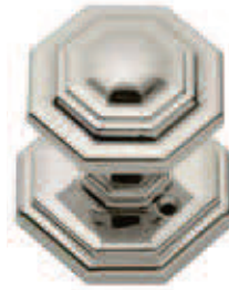
C20100 Q 58x58