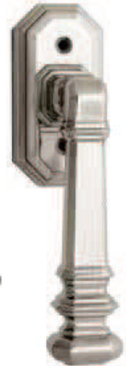
C10110 DK 39x148